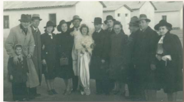
Jewish Wedding, Ferramonti (Calabria) circa 1942